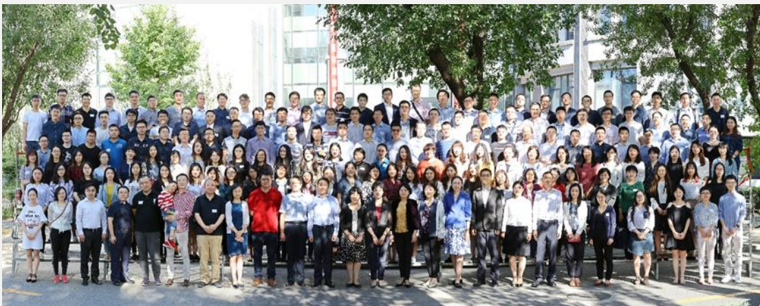
Group photo of faculty and alumni from RMI Department in PKU

The Risk Management and Insurance Student Club was founded in 2001, and our students won national recognitions such as the best project award in the National Insurance Product Innovation Competition, and champion of College Student Mock Court Case. There are over a thousand alumni of RMI program of PKU, providing expertise to risk management and insurance field of China. On the 25th year celebration ceremony, around 150 alumni returned on campus to participate the event. They shared their valuable experience on university education and professional development with students, and donated the "RMI Alumni Scholarships" to the department.